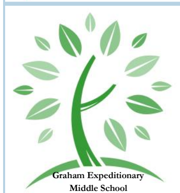
Graham Expeditionary Middle School