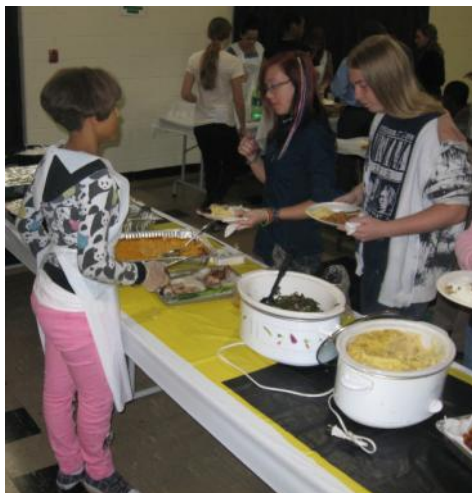
Students, parents, and staff enjoying the food.

TCS celebrated their 5th annual International Dinner on Oct. 13. The dinner was a huge success and everyone had a great time sampling food and talking with parents, teachers and staff of TCS.